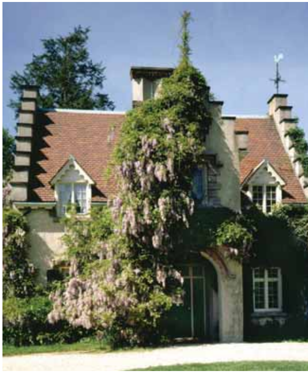
Left: Sunnyside; Below: Philipsburg Manor; Right: Doral Arrowwood's ballroom decorated for a September wedding