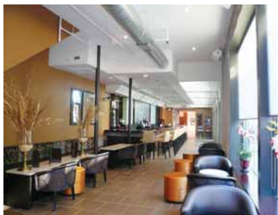
Facing Page: Front of Boscobel House at Boscobel House & Gardens; Left: SOMA dining area